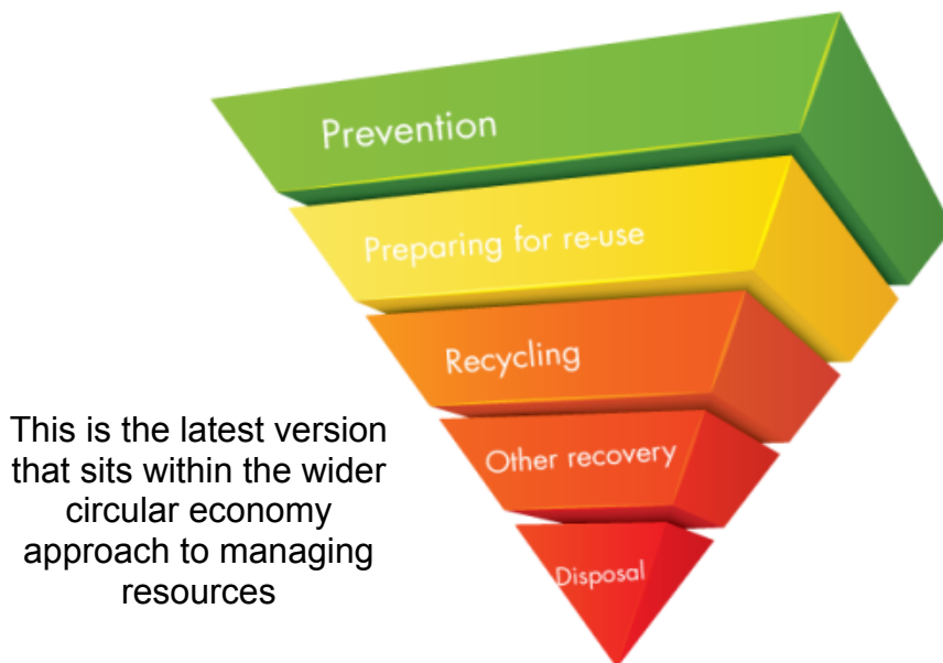
Figure 1 Waste Hierarchy

2.1 As part of its overarching Waste Strategy and its principle of helping protect the environment by prevention and minimisation of waste, BCC seeks to prevent and reduce waste in accordance with the following waste hierarchy. BCC encourages Buckinghamshire residents to support this waste hierarchy which ranks the various waste management options in order of environmental impact. This is the basis of the Waste Management's communication plan. The waste hierarchy is based on environmental foot printing and is widely accepted by experts in the waste industry: